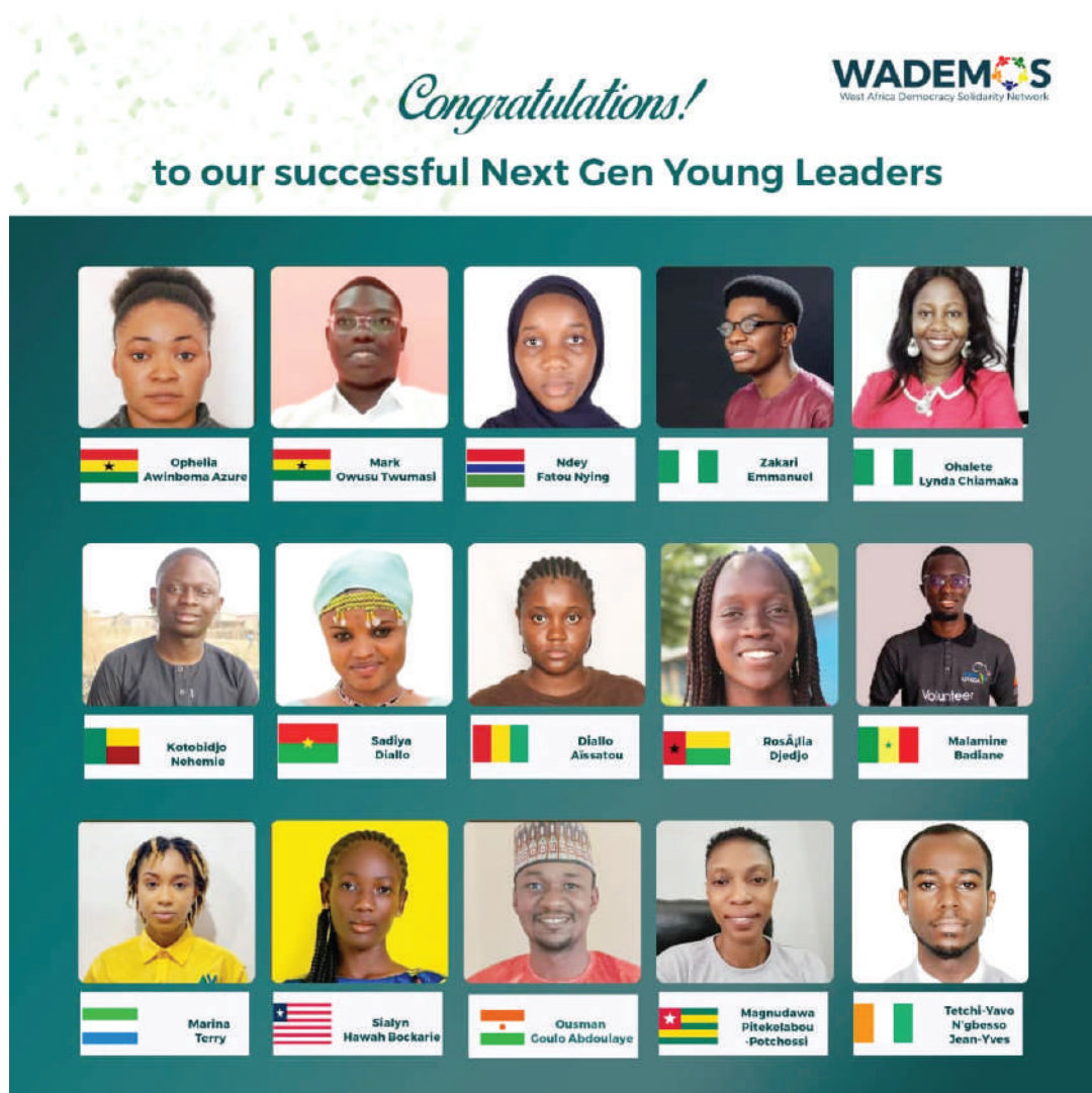
FIGURE 4: Next Generation Initiative (NGI) to empower young

Generally referred to as Next Gen, WADEMOS introduced the Next Generation Initiative (NGI) to empower young people as the current and next generation of democracy defenders, activists, and leaders to drive social change and innovation in West Africa.