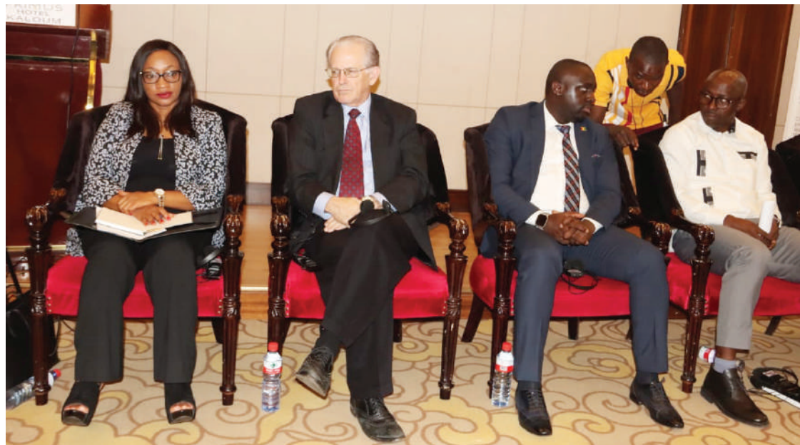
FIGURE 8: Representatives of the Guinean junta at the CSO Convening in Conakry