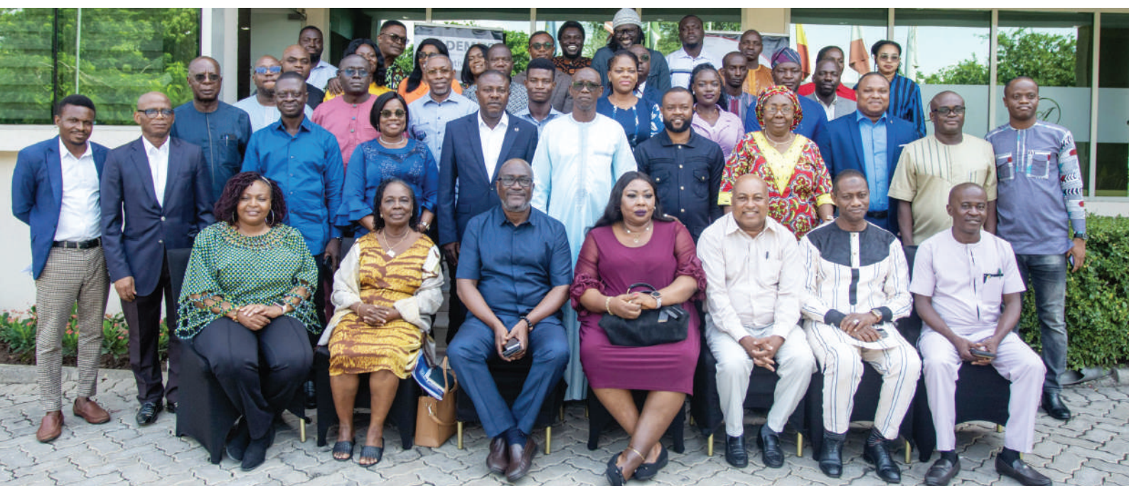
Figure 1: Group picture of participants at the WADEMOS 2nd Annual Members Conference in Accra, Ghana, November 2023

In 2023, WADEMOS held three Steering Committee meetings and also increased the number of members of the Steering Committee from 8 to 11 to ensure gender and language representation are fairly balanced. In relation to the Advisory Council, WADEMOS held consultations and meetings with very prominent and distinguished personalities in the region and beyond whose influence and recognition could be leveraged to intervene and support crisis mediation in West Africa. WADEMOS will deepen these consultations and advance the process towards the inauguration of the Council.