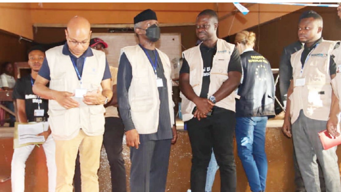
FIGURE 9: WADEMOS election day mission to Sierra Leone