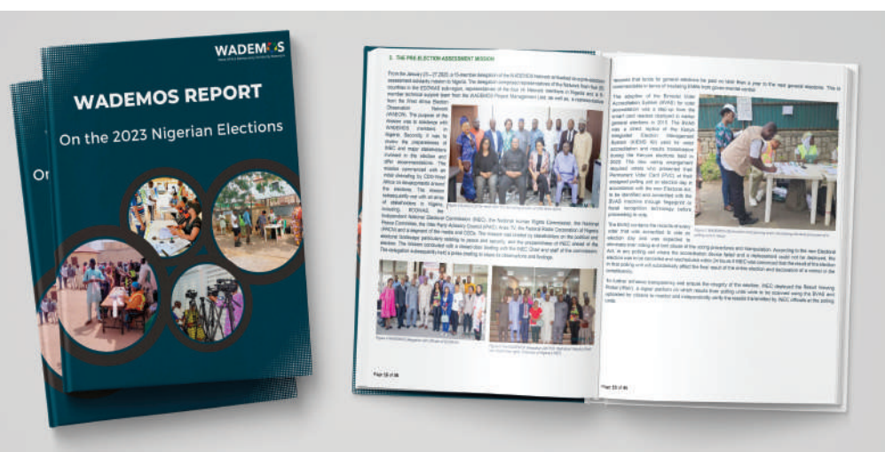
Figure 2: A report on Nigeria's 2023 elections

Twitter Spaces and webinars are two of the avenues used for advocacy on digital media. In 2023, we held three X spaces (Twitter) spaces focused on the Nigerian, Sierra Leonean, and Liberian elections. The essence of the discussions was to engage the public on thematic issues that had dominated discussions in the lead-up to the elections.