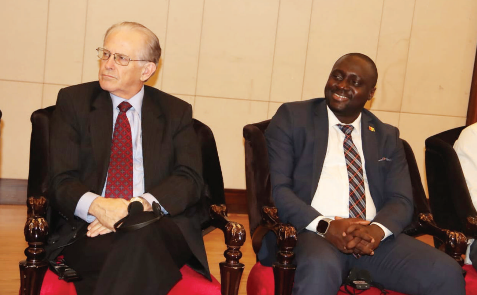
FIGURE 13: Representatives of the Guinea Junta at the CSO convening in Guinea