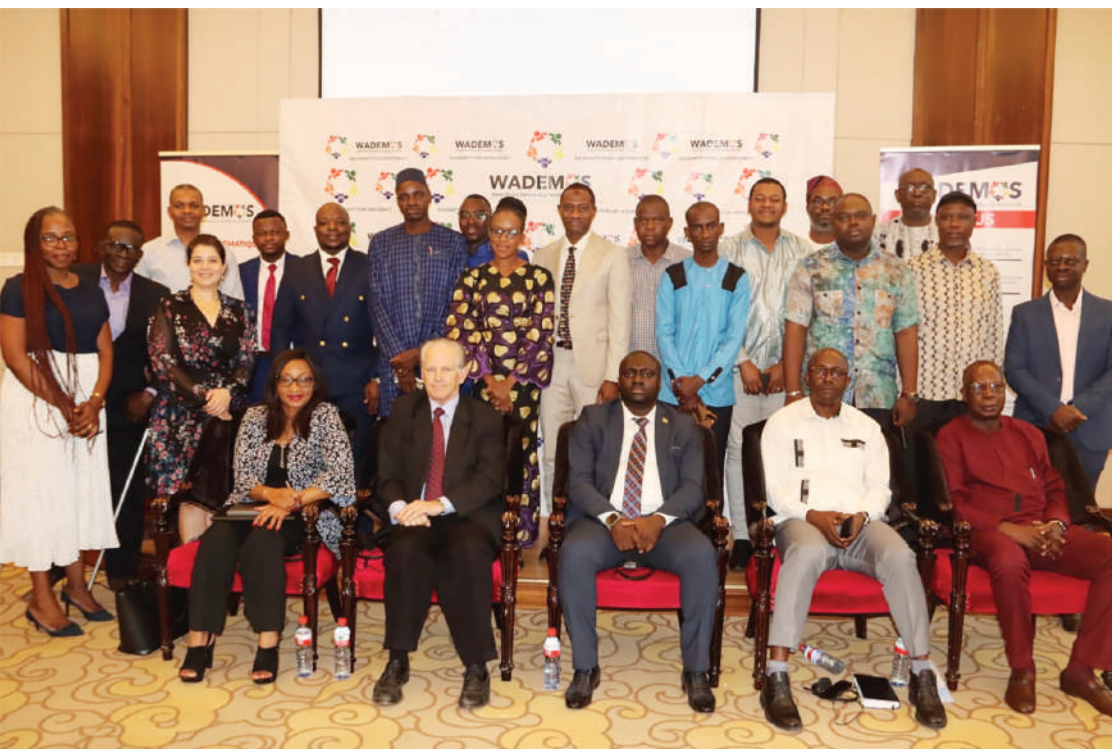
FIGURE 5: CSO convening on Transition Countries' Initiative in Guinea