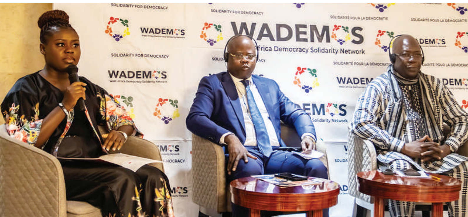
FIGURE 3: CSO Convening on term limits in Abuja, Nigeria

Under this objective, WADEMOS, in partnership with TLP of Togo, and civil society across West Africa, launched a regional campaign for the review of the ECOWAS protocol including the standardization of term limit in West Africa. In addition, WADEMOS collaborated with ECOWAS and AU for the Annual Network Convening in Accra and the Regional Conference on Democracy Decline in West Africa. Specifically, WADEMOS embarked on a campaign against presidential term extension and the violation of human rights and freedom in Senegal and West Africa. The initiative was supported by the Open Society Foundations Regional Office. The overall objective of the project is to sustain a civic campaign against presidential term elongations and human rights abuse in West Africa and Senegal and the review of the ECOWAS supplementary protocol on Democracy and Good Governance