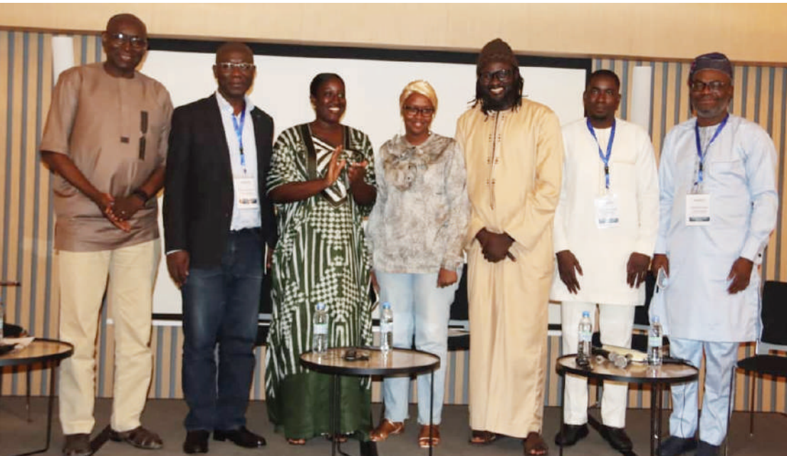
FIGURE 7: Group picture after a panel discussion at the francophone Conference