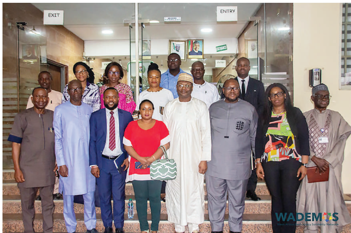
FFIGURE 6: WADEMOS Pre-election delegation to Nigeria in a group picture with the Nigeria EC Chairperson