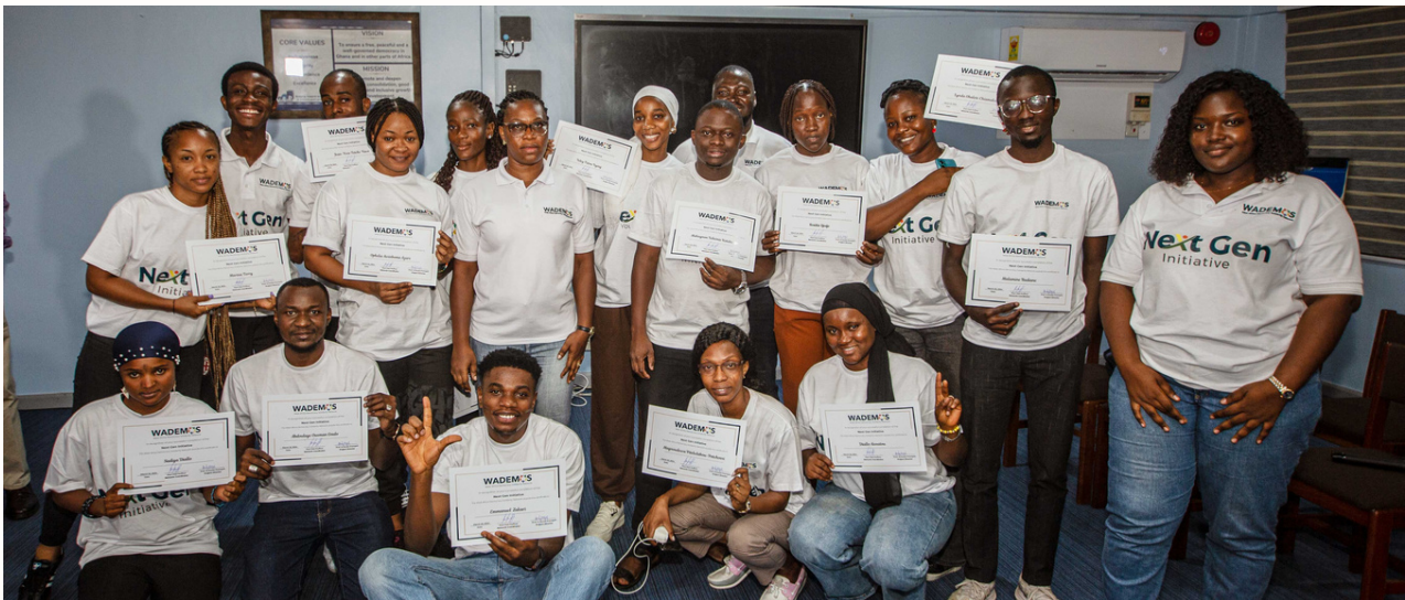
● The Young Leaders in a group picture after receiving their certificates at the closing ceremony