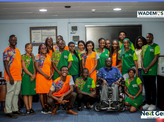
Next Gen Initiative